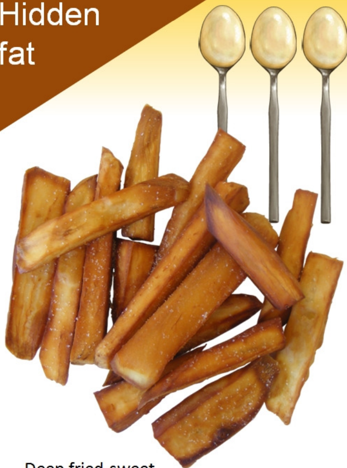
Deep fried sweet potato chips