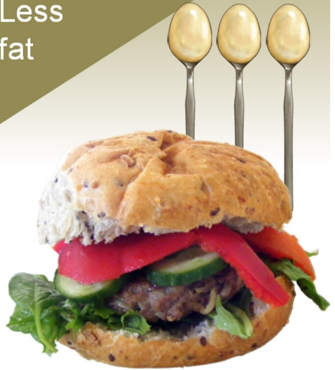
Burger with salad vegetables