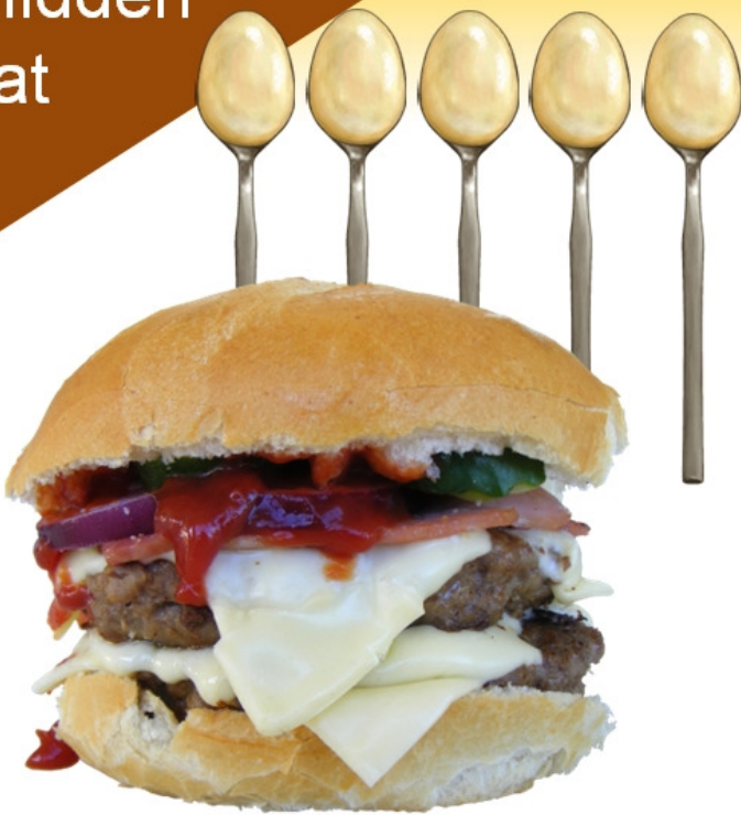
Burger with extra cheese & bacon