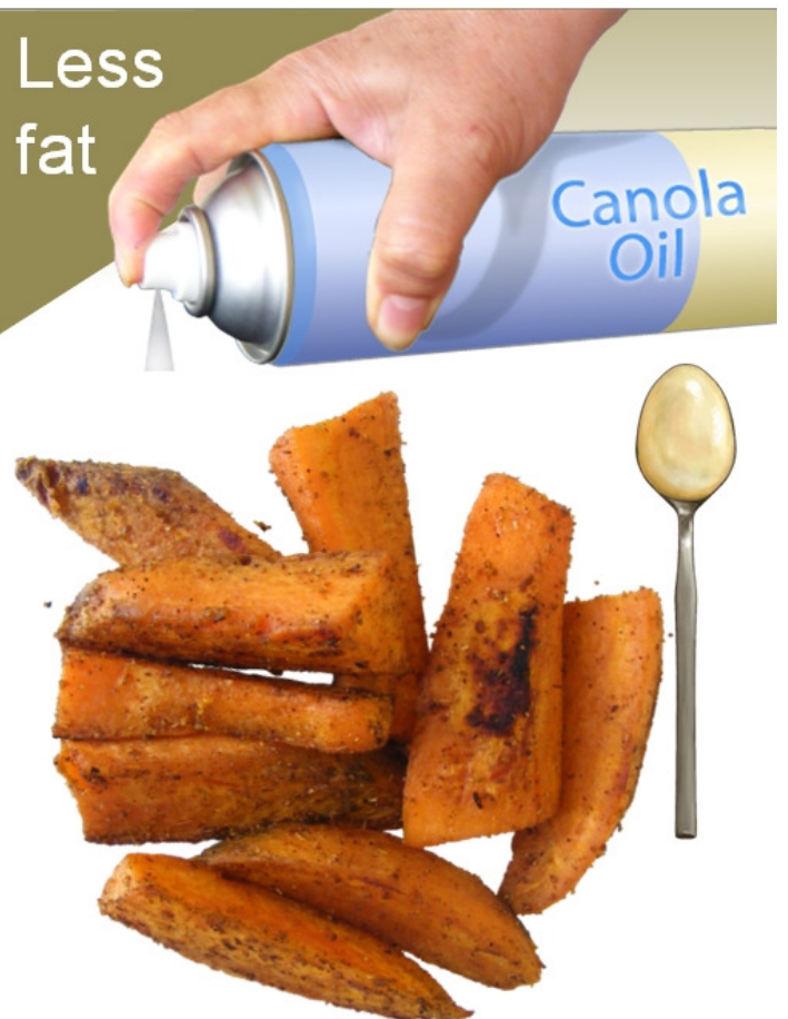
Sprayed & baked sweet potato chips