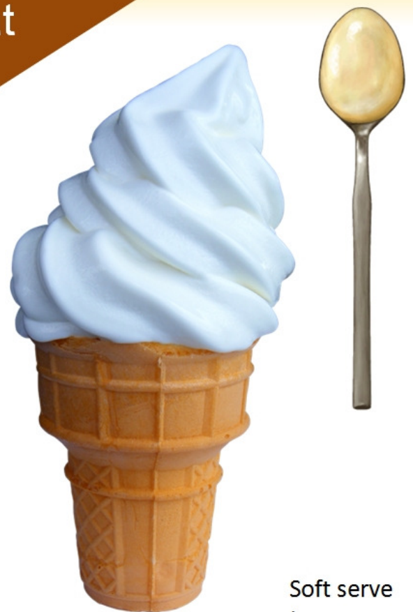
Soft serve ice cream